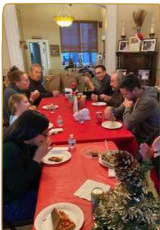
The group enjoying some pizza after all the work!

We would like to take the opportunity to thank two local vendors who have been part of the Ss Peter and Paul Christmas decorating team for many many years now.